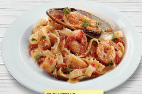
TAGLIATELLE SEAFOOD GAMBERO

Marinara-style pasta—shrimps, mussel, cream dory and tagliatelle tossed in a tangy tomato herb sauce 32