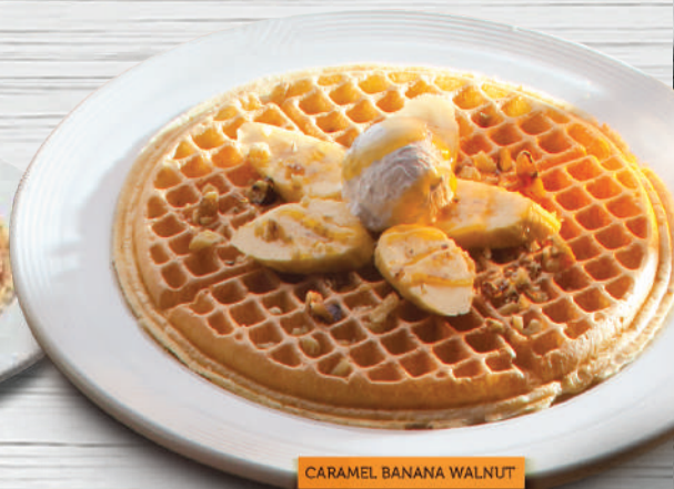
CARAMEL BANANA WALNUT