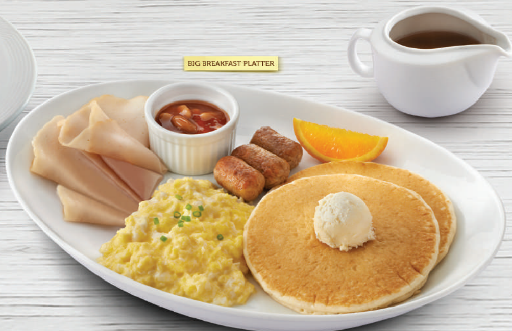
BIG BREAKFAST PLATTER