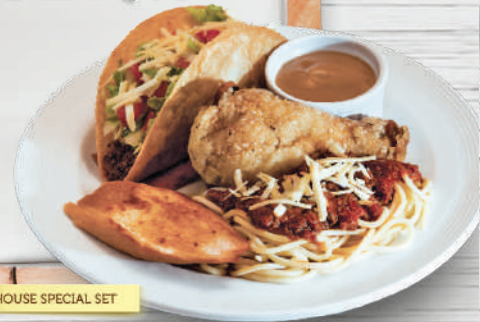
HOUSE SPECIAL SET

Pan Chicken + Best Taco in Town + Spaghetti + Garlic Bread + Beverage