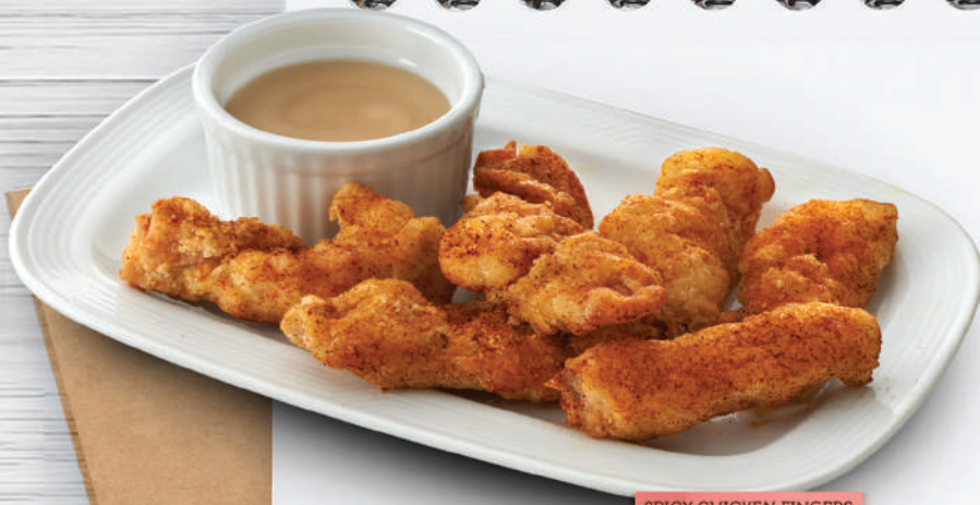
SPICY CHICKEN FINGERS