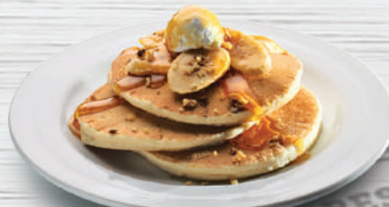
CARAMEL BANANA WALNUT