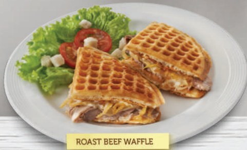
ROAST BEEF WAFFLE