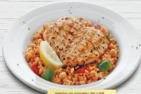
SPICY CHICKEN FILLET WITH BROWN RICE PILAF

Flavorful brown rice pilaf paired with tender chicken paillard and garnished with garlic cream mayo, chopped parsley, and lemon wedge 35