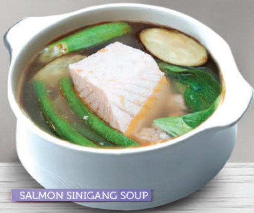
SALMON SINIGANG SOUP