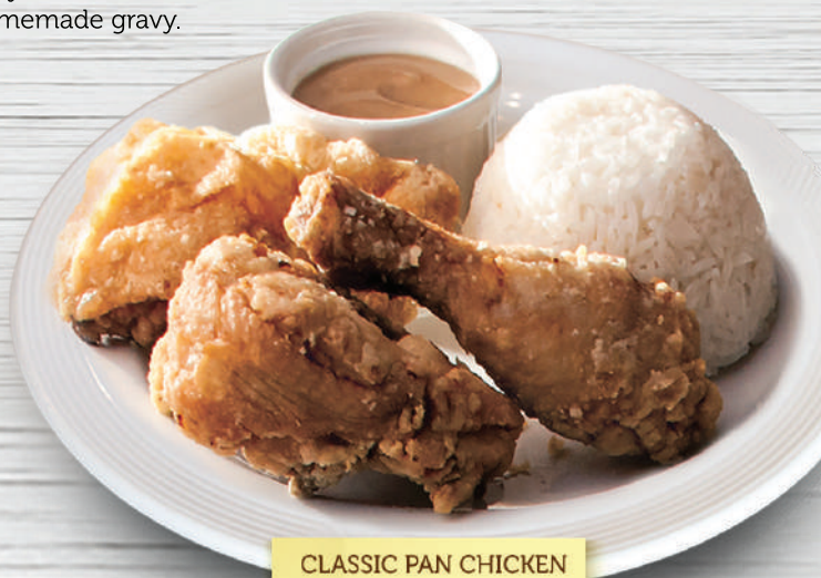
CLASSIC PAN CHICKEN