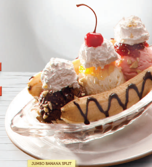
JUMBO BANANA SPLIT