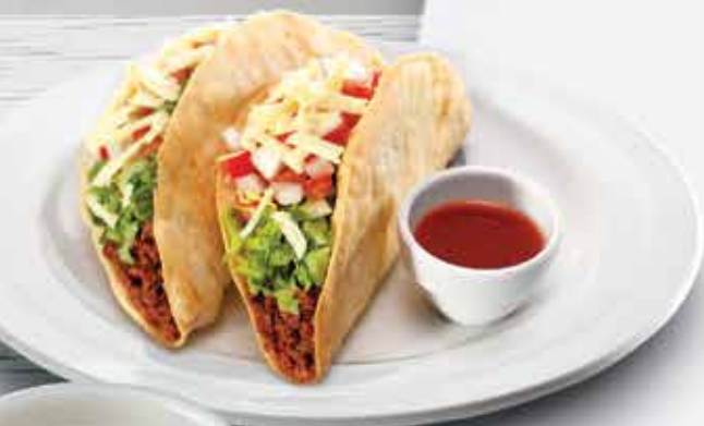
BEST TACO IN TOWN

Deep fried boneless chicken strips coated with cayenne powder and served with gravy 18