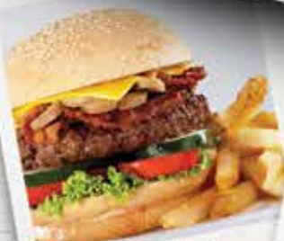
JUMBO HOUSE BURGER