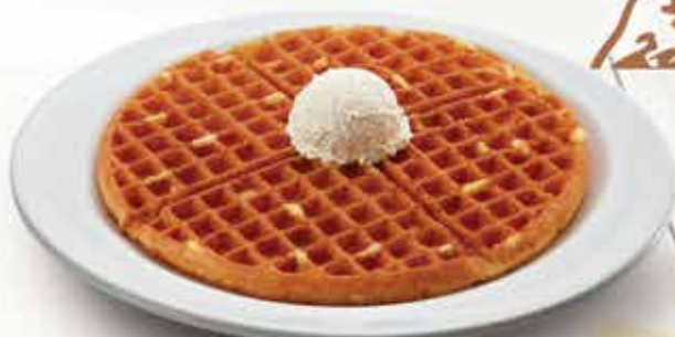
GOLDEN BROWN WAFFLE