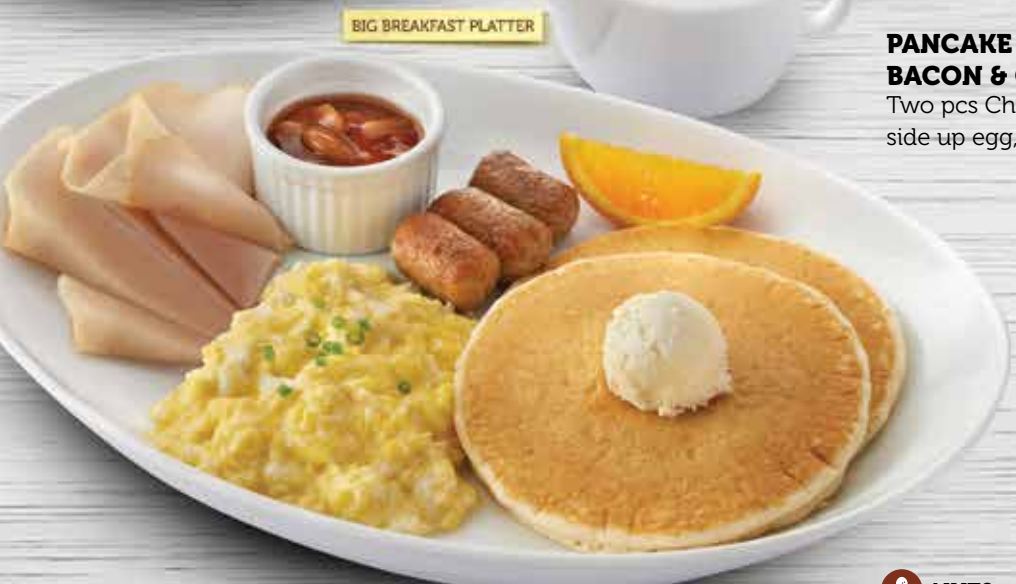
BIG BREAKFAST PLATTER