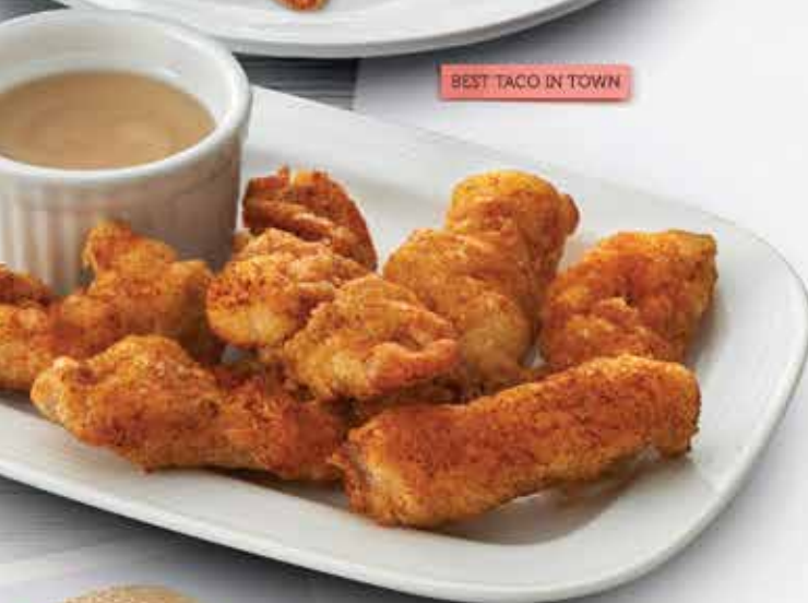
SPICY CHICKEN FINGERS