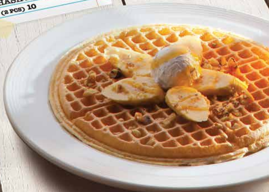
CARAMEL BANANA WALNUT