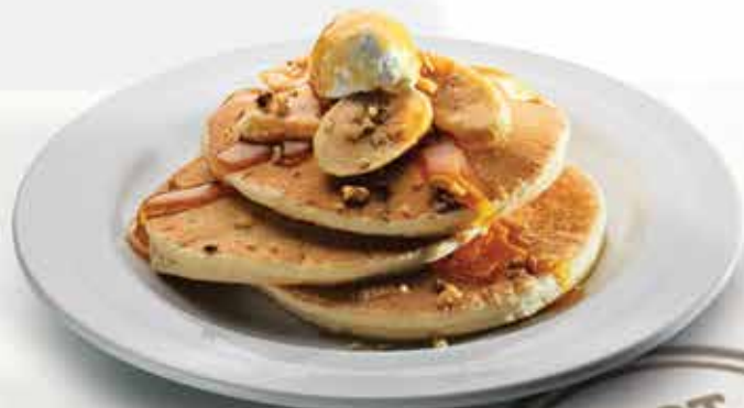
CARAMEL BANANA WALNUT

You'll go nuts over these rich and flavorful walnut-filled pancakes (2 pcs) 24 (3 pcs) 28